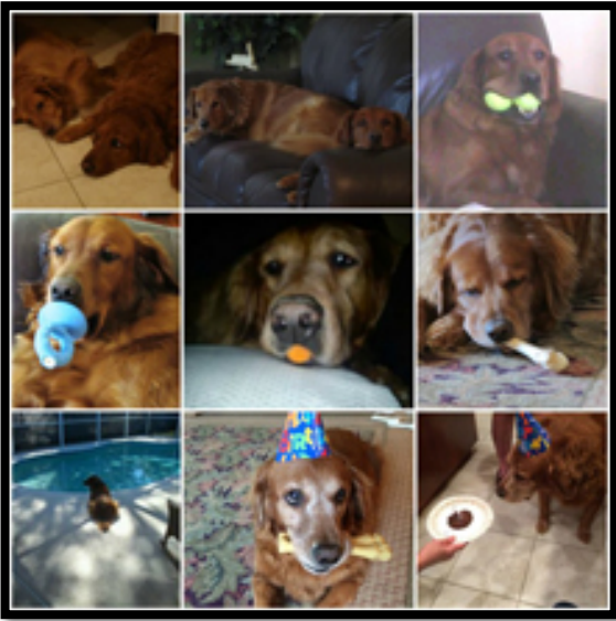
TUCKER (GH 289)

Tucker came into our lives with his sister Tawny (GH-288) in May of 2011. They both turned 8 the next month. Originally, we were to foster them for a few weeks after picking them up in Orlando since we were taking a road trip up north to Pennsylvania. Once these two beauties walked into our home, we all knew they were meant for us. We always had Golden Retrievers and our house seemed alive again with Tucker & Tawny a part of the family. We cancelled the road trip! It's the best decision we ever made!!