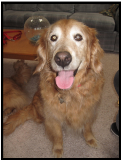
MACY (GH 943)