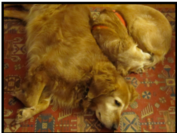
LIFFEY (GH 635) BEAR (GH 668)

Liffey came to us on April 7, 2010 from a shelter where her owners asked that she be euthanized. Instead GoldHeart came to the rescue. Liffey had been neglected and only partially socialized. She did not know how to respond to attention – but she was an escape artist and rejoiced in running away repeatedly. She was small and scooted through the most narrow openings. Chasing her kept us in shape! When we adopted Bear on September 2, 2010 Liffey (who never learned to play with other dogs) found a friend. During the day Liffey loved to chew on sticks or better still on marrow bones which she then buried and sometimes found again covered with dirt and tastier than ever. However at naptime or at night she curled up next to Bear and slept like a log (unless there was a thunder storm!) but that is another story. We never learned Liffey's age –she was NOT young – she died 4 years ago of a tumor detected only by x-ray. During her time with us Liffey received much love even if she did not know how to return it.