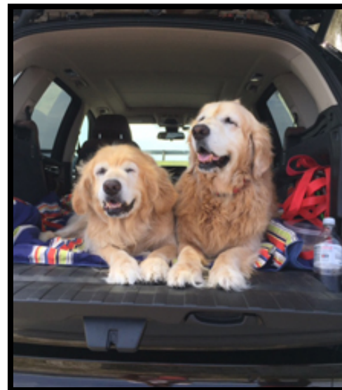
CARSON (GH 768) APACHE (GH 767)