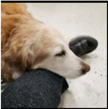
BELLE (GH 1087)

We lost dear, sweet Belle to congestive heart failure on 2/21/19. She was 2 months shy of her 15th birthday. Even though we only had her for 3 1/2 months, we loved her as much as if we had had her for her whole life. You would never know she was deaf. Everybody loved her and she, of course, loved everyone....even the cat. We will dearly miss sweet, sweet Belle and all the joy she brought. She will be with us always in our hearts.