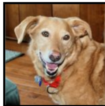
BOO (GH 698)