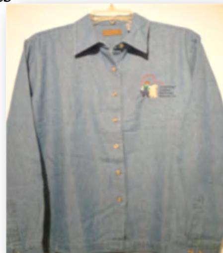
Denim Long-sleeved Shirt