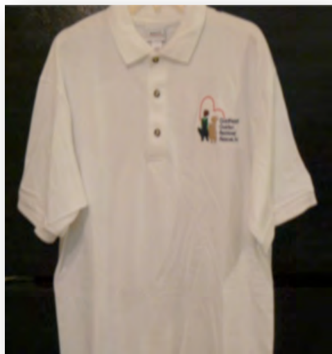
White Polo/Golf Shirt